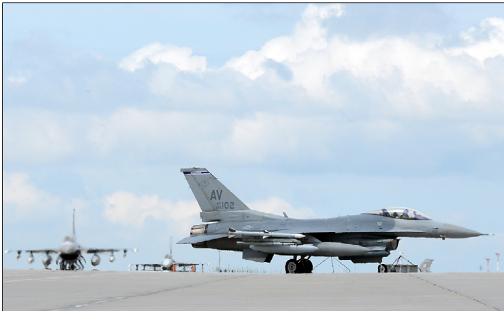
U.S. Air Force F-16 Fighting Falcon fighter aircraft taxi off of the flightline here July 12, 2013. The six aircraft are from Aviano Air Base, Italy, and are participating in the third aircraft rotation to Detachment 1, 52nd Operations Group. The aviation detachment is part of an ongoing effort to strengthen Polish and U.S. ties.