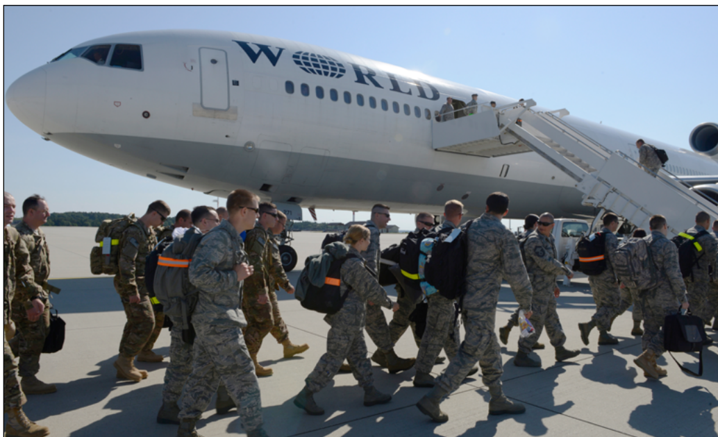
U.S. Air Force members from the 606th Air Control Squadron board a plane bound for a deployed location July 8, 2013. The 606th ACS deployed to Southwest Asia for several months to provide air defense of the Arabian Gulf.