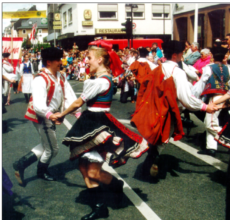
For the 49th year straight, folk dancing ensembles from all over Europe and other continents have danced at the annual Bitburg Folk festival, a highlight event in the Bitburg region. This year's event is scheduled for July 12-15, offering fun for young and old. Participants will be dressed in their traditional outfits, representing their own country and region, entertaining visitors from far and near with traditional folk dances and music. This festival typically attracts ten thousands of people, who flock into the famous beer city four days straight.

Read the entire article at http://www.spangdahlem.af.mil/news/story.asp?id=123355563