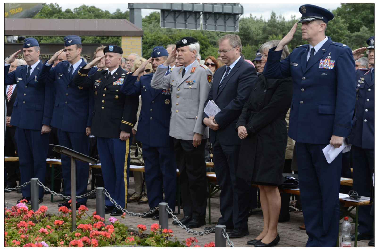
Military service members salute during the playing of the U.S. and German national anthem during the 65th anniversary of the Berlin Airlift at the Berlin Airlift Memorial in Frankfurt Germany June 26, 2013. Service members from the U.S. Army and U.S. Air Force were present to show their respects during the ceremony.