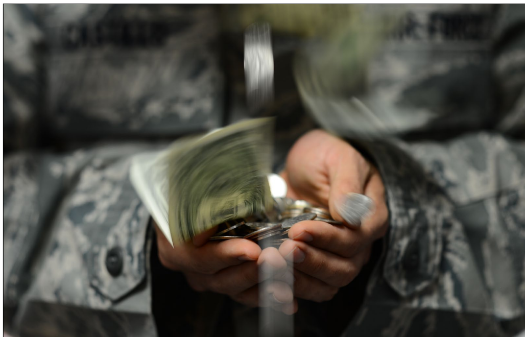
Military Saves Campaign kicks off February 25, and runs through March 2.

PTSD and TBI: One Airman's road to recovery