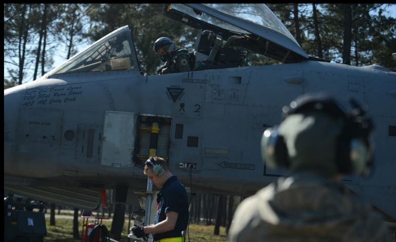
U.S. Airmen from the 81st Aircraft Maintenance Unit prepare an A-10 Thunderbolt II aircraft for take-off in Monte Real, Portugal, Feb. 14, 2013.

The exercise helps keep pilots from the 81st combat-ready because of the different skill sets that they can train on here. Some of the sce-