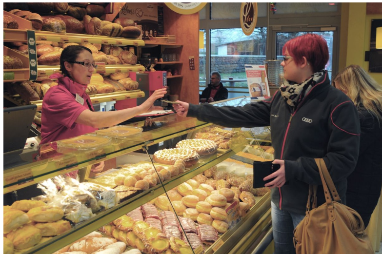
A baker at a local supermarket sells baked goods to patrons Jan. 29, 2013. Most supermarkets have a bakery located inside or outside their facilities. Fresh breads are available, including whole grain products, broetchen, donuts and cake.

Read more online at http://www.spangdahlem.af.mil/news/story.asp?id=123334336 .