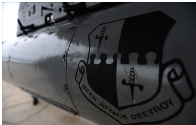
An 81st Fighter Squadron A-10 Thunderbolt II displays a 52nd Fighter Wing patch on the flightline Jan. 24, 2013.

The 81 FS flies the A-10 Thunderbolt II, or "Warthog," a twin-engine jet aircraft capable