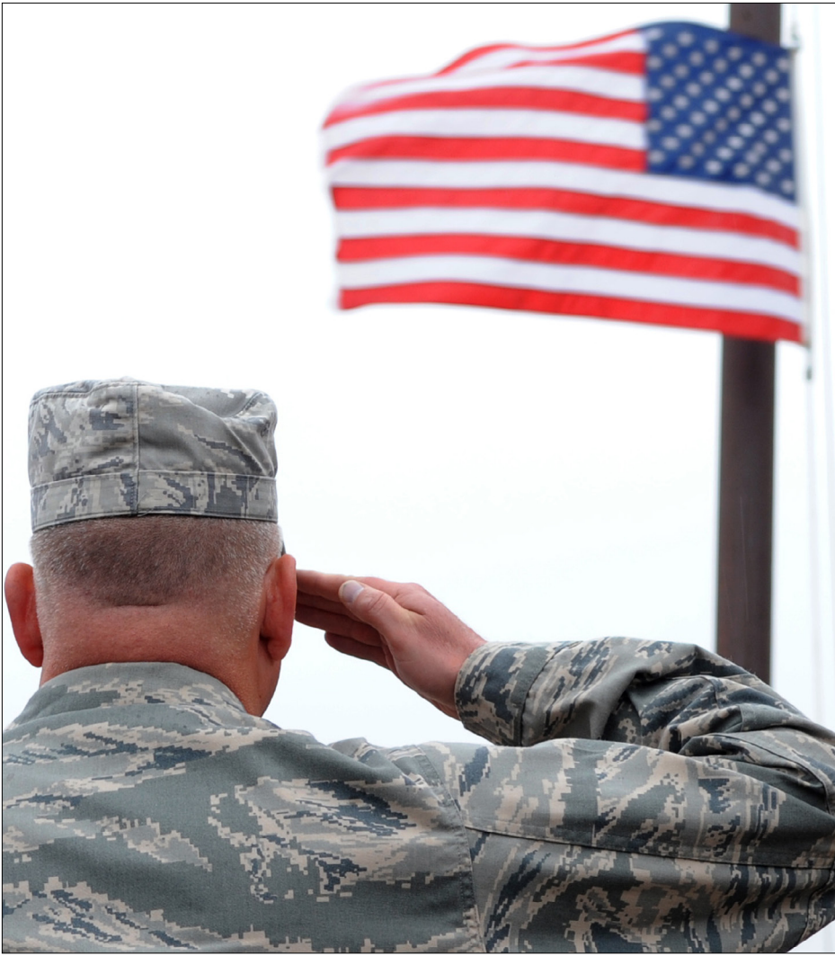
An Airman salutes during a Memorial ceremony.

Read the entire commentary at http://www.spangdahlem.af.mil/news/story.asp?id=123329065 .