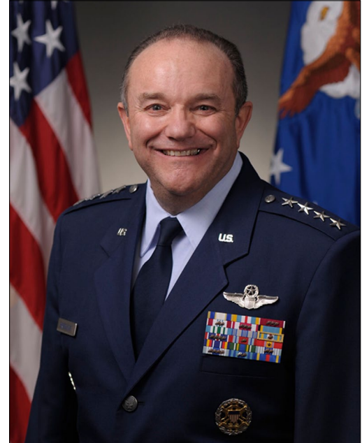
Gen. Philip M. Breedlove, U.S. Air Forces in Europe Commander.

Read the entire article at http://www.ramstein.af.mil/news/story.asp?id=123313017 .