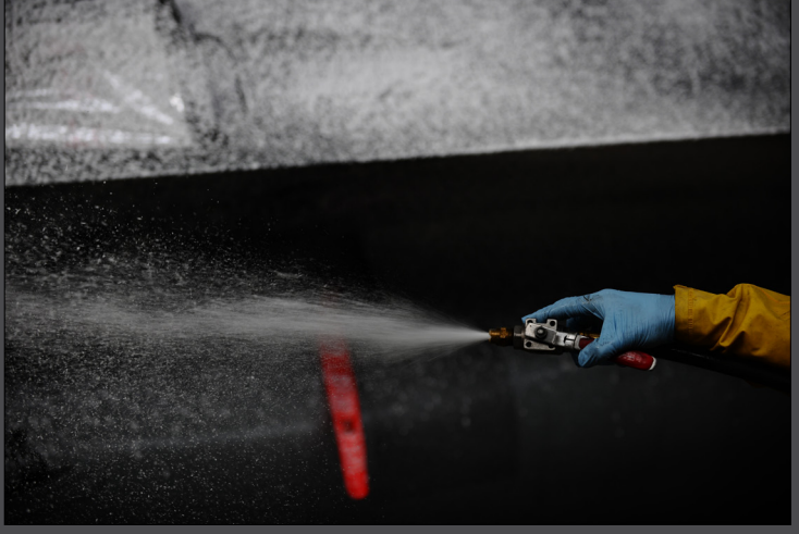
Dustin Bowers, 52nd Equipment Maintenance Squadron Fabrication Flight corrosion control civilian contractor, sprays soap on the wing of an F-16 Fighting Falcon in Hangar 3 here May 11.

Josh Larkin, 52nd Equipment Maintenance Squadron Fabrication Flight corrosion control civilian contractor, scrubs the landing gear on an F-16 Fighting Falcon in Hangar 3 here May 11.