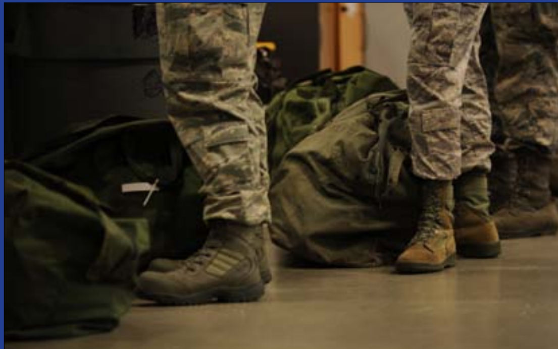
Airmen from the 52nd Fighter Wing are issued chemical training gear as part of their in-processing to the base at Bldg. 103 here April 18.