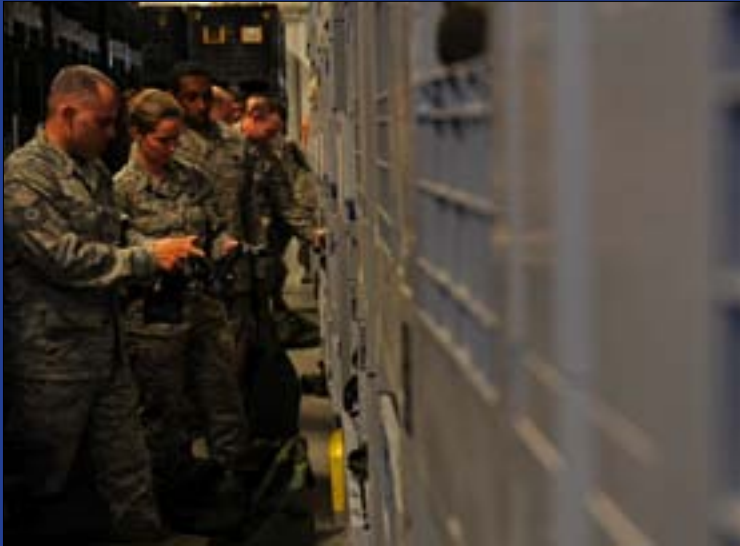
Above: Airmen from the 52nd Fighter Wing gather chemical training gear as part of their in-processing to the base at Bldg. 103 here April 18.